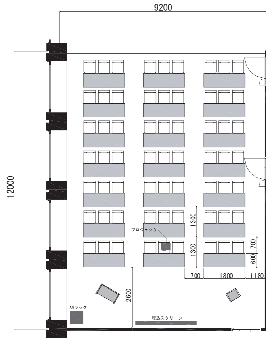
Room B1 63名席